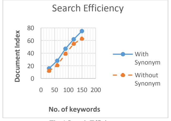
Fig.4 Search Efficiency

Search Efficiency is shown in the Fig. 4. It can be seen that number of indexes generated for the document will be